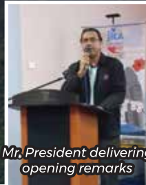
Mr. President delivering opening remarks