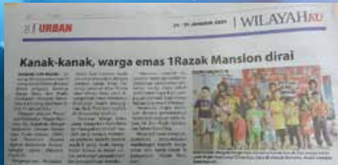
Program Seminar Warga Emas - Wilayahku 24-30 January 2020