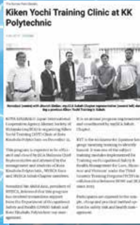
THE BORNEO POST (SABAH) 4 DEC 2019