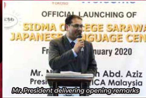
Mr. President delivering opening remarks