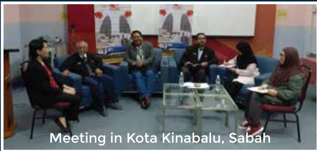
Meeting in Kota Kinabalu, Sabah