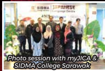
Photo session with myJICA & SIDMA College Sarawak