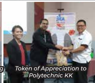
Token of Appreciation to Polytechnic KK