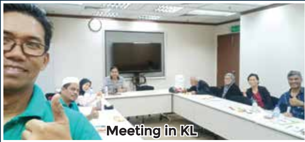
Meeting in KL

MYJICA Exco Meeting conducted 3 times in KL, KK and Kuching.