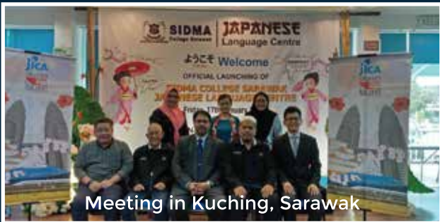
Meeting in Kuching, Sarawak