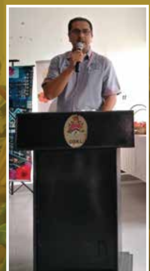
Welcoming remarks by 1 Razak Mansion RA Chairman