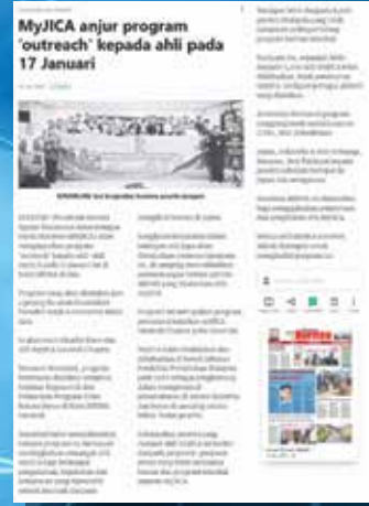
UTUSAN BORNEO (SABAH) 16 JAN 2020