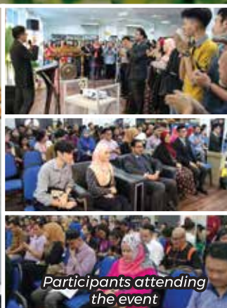
Participants attending the event