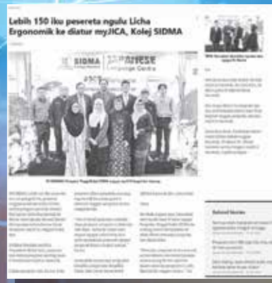
UTUSAN BORNEO (SARAWAK)-BERITA IBAN 19 JAN 2020