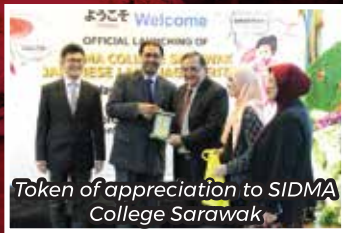
Token of appreciation to SIDMA College Sarawak