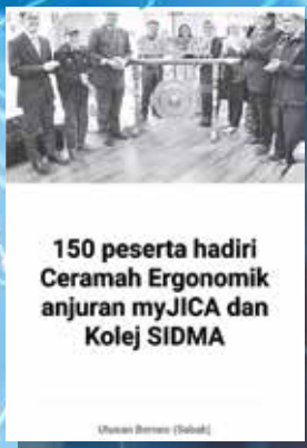
UTUSAN BORNEO (SABAH) 19 JANUARY 2020