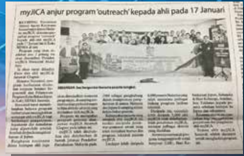
UTUSAN BORNEO (SARAWAK) 16 JAN 2020