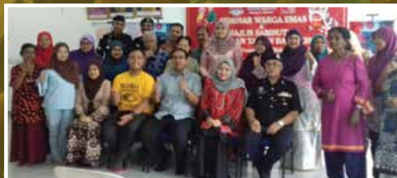
Photo session with participants