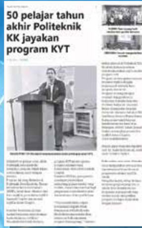
UTUSAN BORNEO (SABAH) 7 DEC 2019