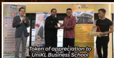
Token of appreciation to UniKL Business School