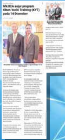
UTUSAN BORNEO (SABAH) 4 DEC 2019