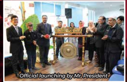
Official launching by Mr. President