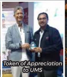
Token of Appreciation to UMS