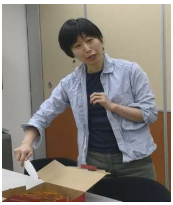
Mesyuarat Agong Tahunan myJICA ke-32 INSTITUT PENDIDIKAN GURU MALAYSIA (IPGM) Kementerian Pendidikan Malaysia Aras Bawah, 1 Century Square, Jalan Usahawan, Cyber 6, 63600 Cyberjaya Selangor Darul Ehsan