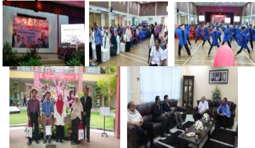
myJICA with KUIS & MJII Top Management

MYJICA has been invited to attend the opening ceremony of Japanese Cultural Event which is organised by MARA-Japan Industrial Institute on 18 April 2017 at Beranang, Selangor.