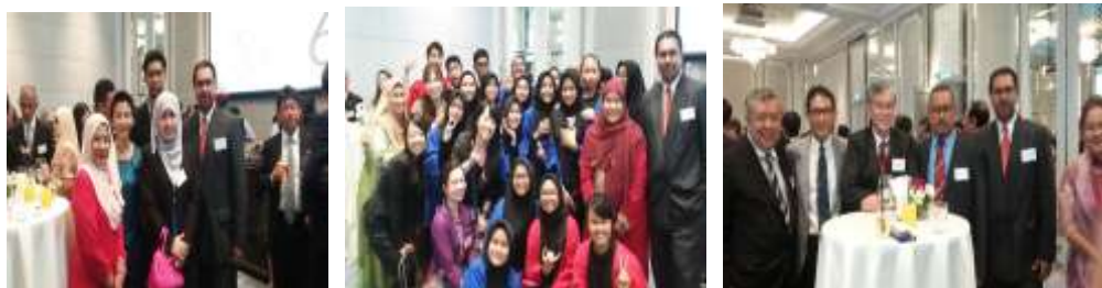
myJICA with Ex-MITI Minister, PAMAJA, JAGAM & ALEPS