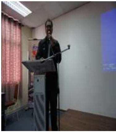
President of myJICA officiate the KYT Clinic