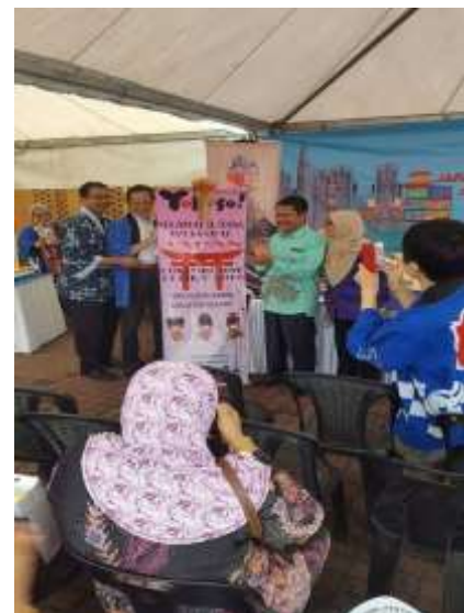
JCD officiated by DG of ROS