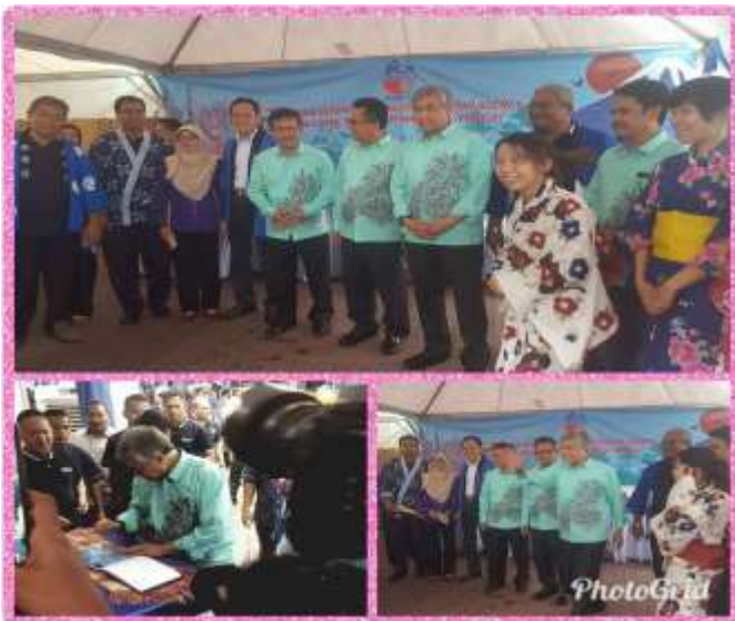
Deputy Prime Minister visiting myJICA booth

Through JCD, the local community has a better understanding and had experience themselves on Japanese culture which gives positive impact to JICA and Myjica. This could strengthen the relationship between Japan and Malaysia.