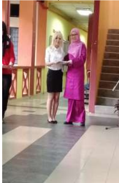
Winner of the Karaoke competition