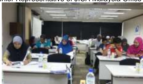
Members attending AGM