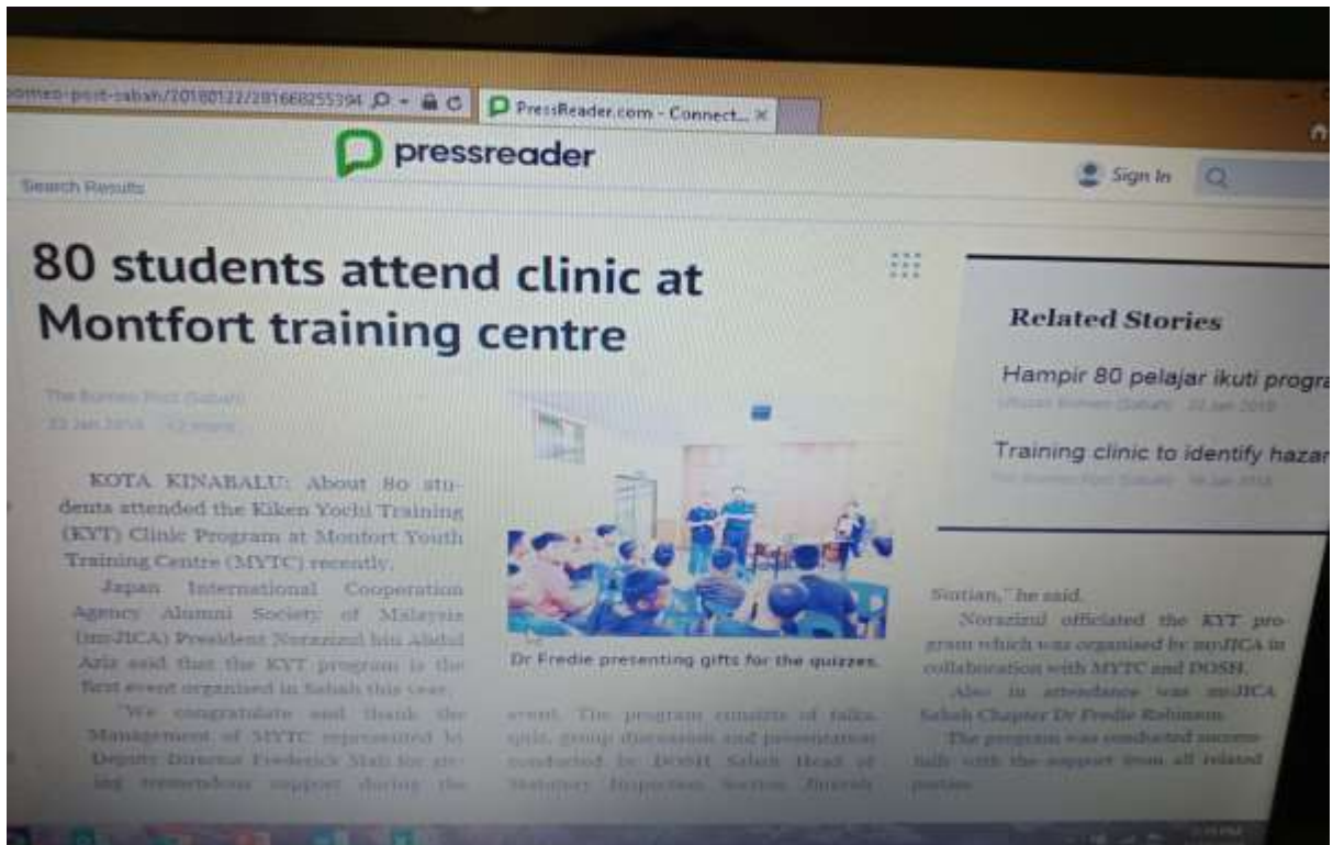
Borneo Post(Sabah)-22 Jan 2018