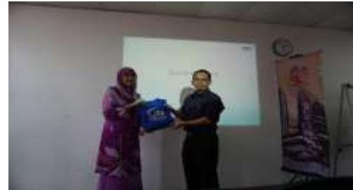
Souvenirs were given to agencies involved in KYT Clinic

As a conclusion, the concept of KYT and its benefits is very useful to be implemented in daily life. We would like to express our gratitude to ILP Kota Samarahan and DOSH Sarawak for their collaboration in this program.