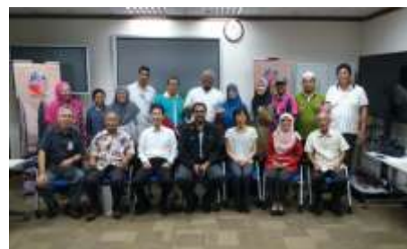
Photo session with JICA reps, Exco and Members