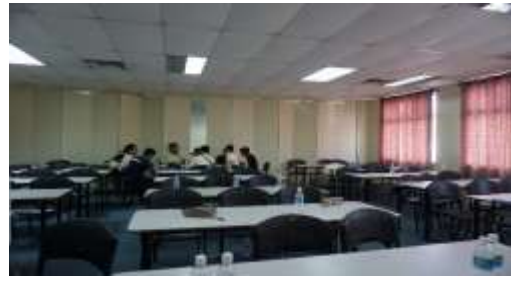
Group exercise in progress