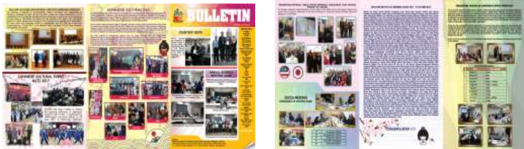
1 st Bulletin

500 pcs myJICA Bulletin have been published for 2 series.