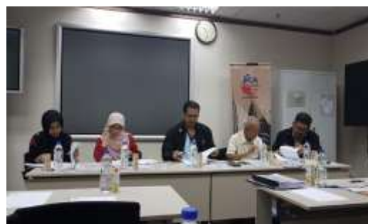
AGM chaired by Mr. President of myJICA